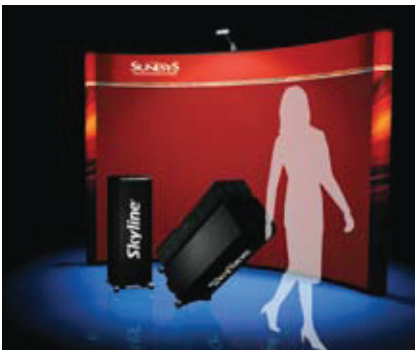
Backlight end panels to bring attention to fabric panels and detachable graphics.

Protects backlighting components and simply attaches to Mirage cases for easy transport.